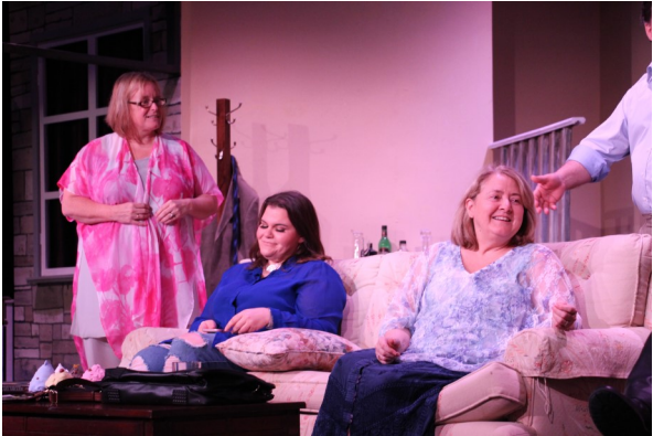
Scenes from Mom's Gift

Sponsorships help HCP to cast, produce shows and assist everyone, from children to seniors, experience theatre, either onstage, backstage, or in the audience. More information is found on the website under About Us